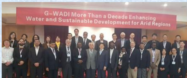
Participants gather for the opening session of the G-WADI Global Conference

The Global Network on Water and Development Information for Arid Lands (G-WADI) celebrated a decade of achievements with an international conference entitled “G-WADI: More than a decade enhancing water and sustainable development for arid regions”. The meeting took place on 25-27 October 2016 in Beijing, China.