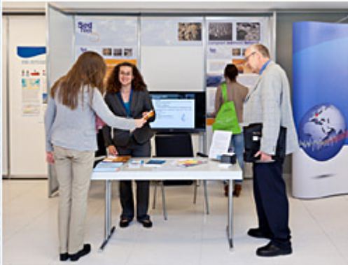
(SedNet at the exhibition of the 6th IAHS International Conference on Water Resources and Environmental Research: Water and Environmental Dynamics)