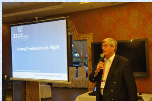
Young Professionals Night!