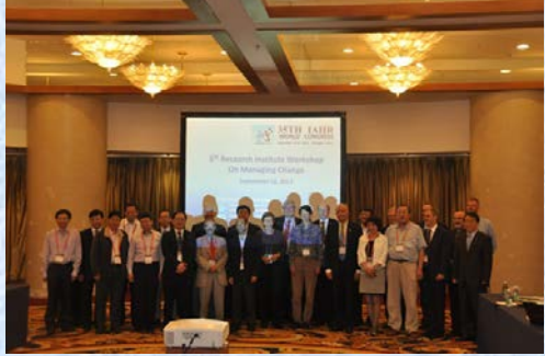
5th Research Institute Workshop On Managing Change